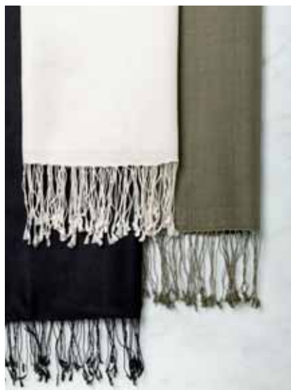
Scarf Silk, cream, olive, chocolate, black $98.00