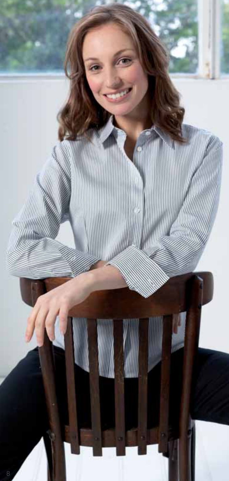
Business Shirt Italian Cotton, white/ black stripe, fine black/ grey stripe, white $198.00