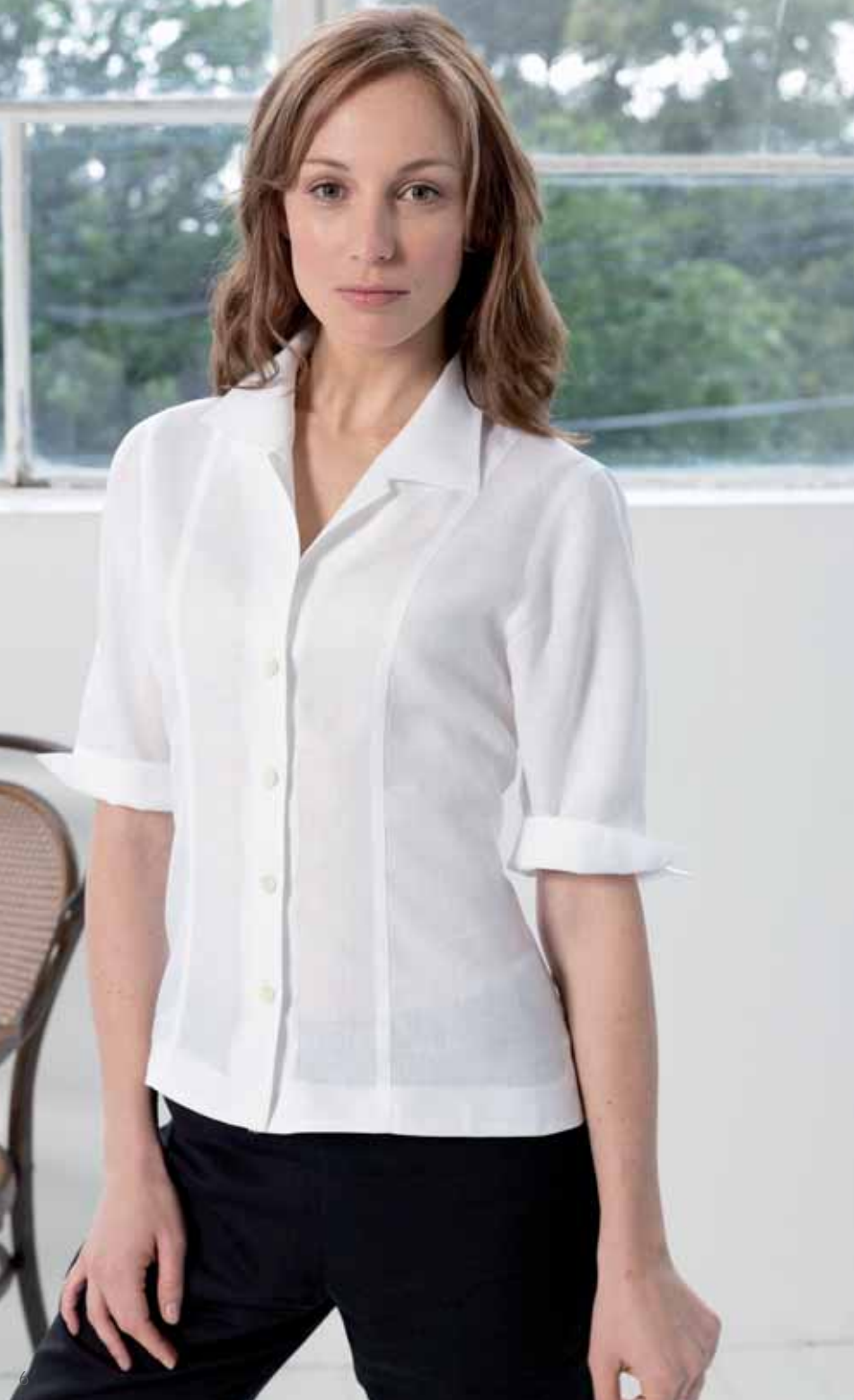
Day Shirt Italian Linen, white, black $238.00