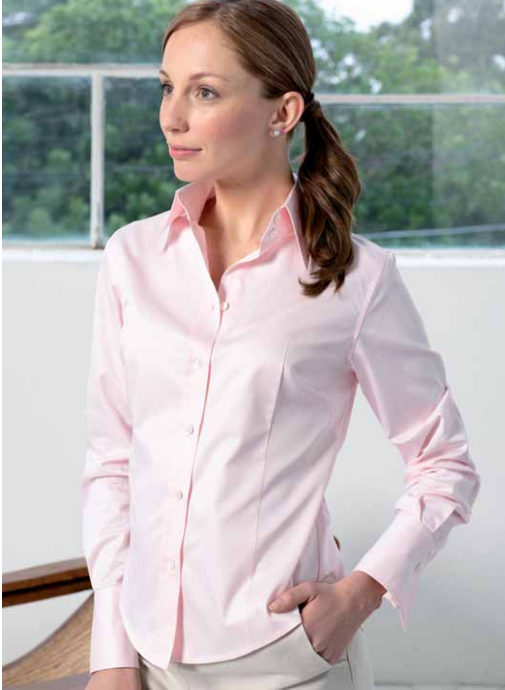
City Shirt Italian Cotton, pale pink, pale blue $210.00