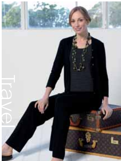
Sleeveless T, Viscose overcast/stripe $75.00 Cardigan, Viscose, black, camo $145.00 Pants Full Length, Viscose, black $170.00

Travel These can be teamed together to form the perfect, crease free holiday wardrobe. Team with a new silk scarf for day or evening.