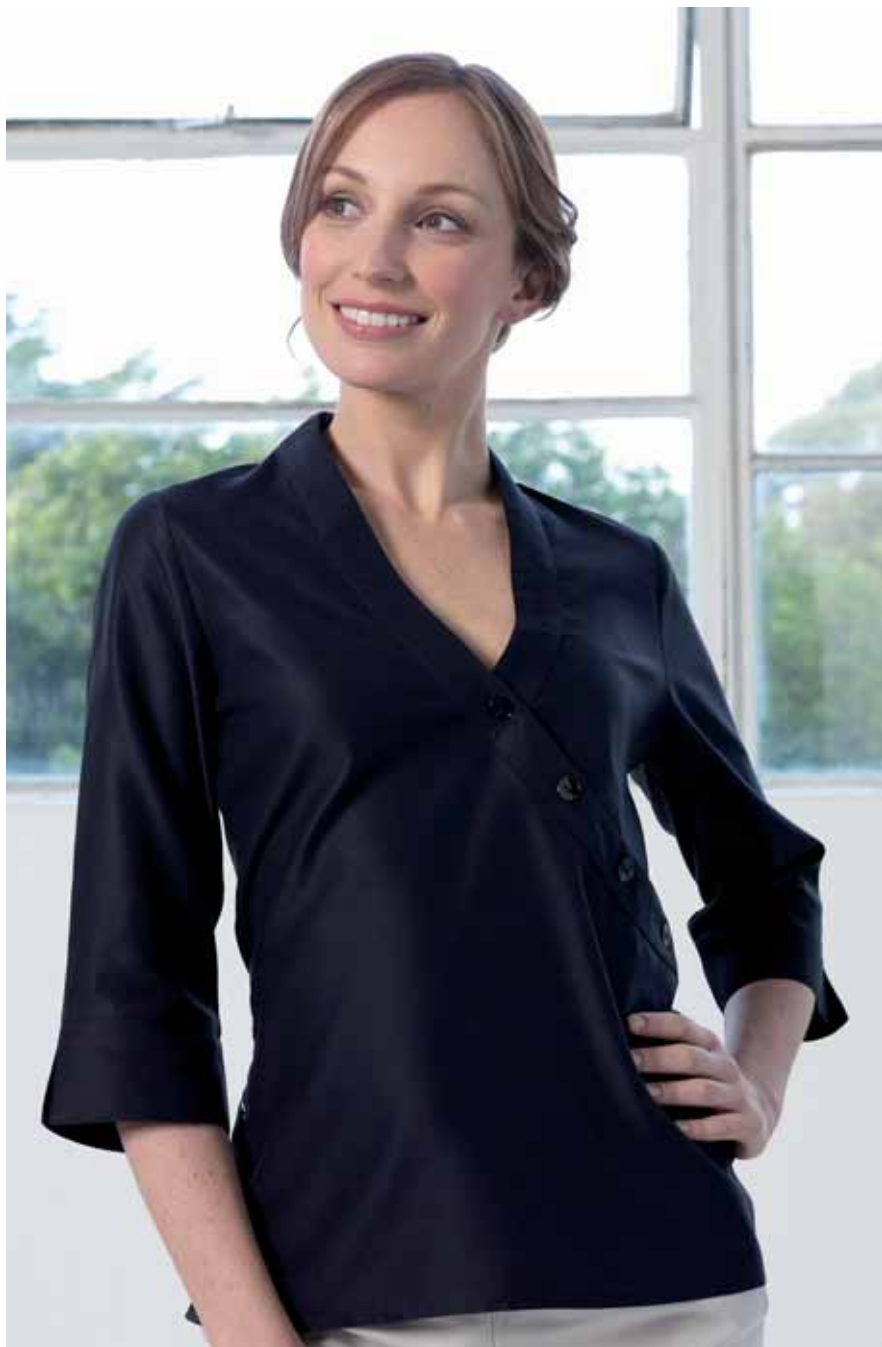
Button Shirt Italian Cotton, black $210.00