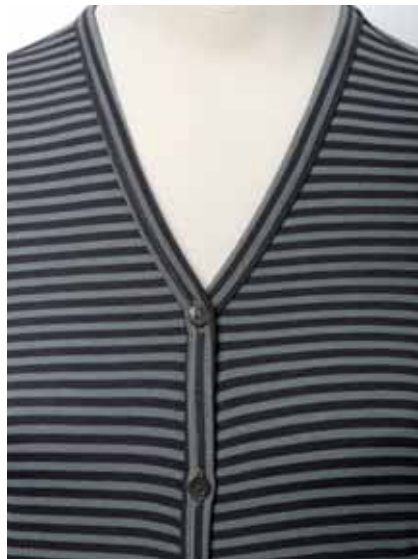
Cardigan Viscose, irish moss/stripe, overcast/stripe $145.00