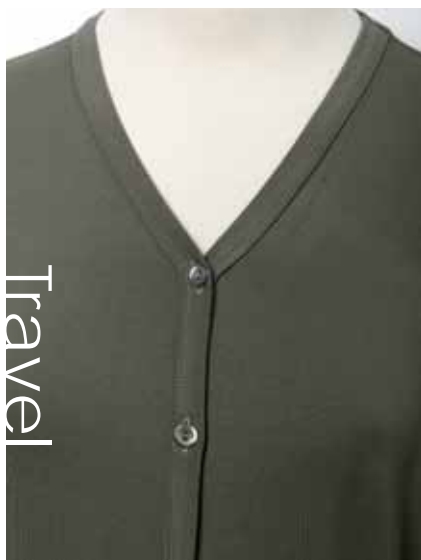
Cardigan Viscose, black, camo $145.00